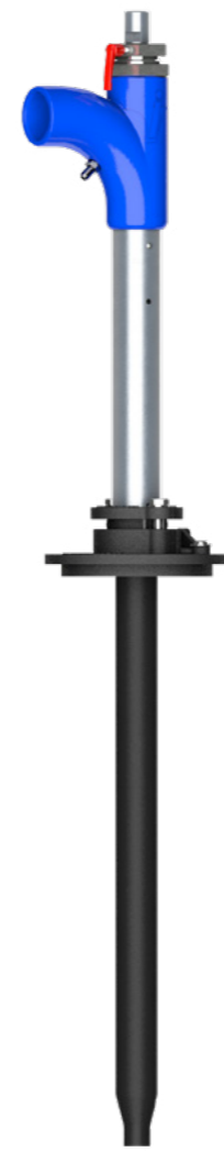
NOVAPULS injector burner lance