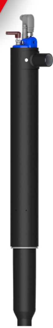
NOVAJET high velocity burner