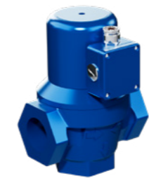
NOVAPULS electromagnetic impulse solenoid valves